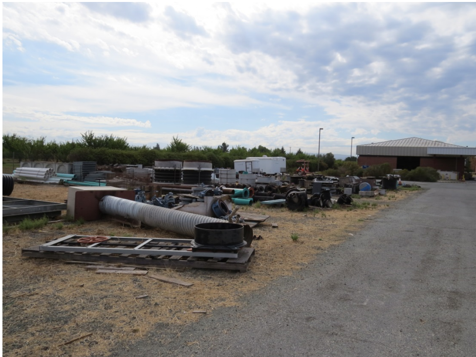
Figure 3-1 View looking south towards the Coyote Pumping Plant (top) and view of miscellaneous materials located on the northeastern portion of the Coyote Pumping Plant (bottom)