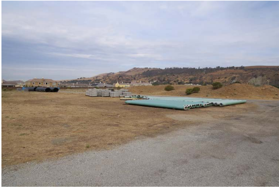
View of the Project site from the south east corner looking northwest.