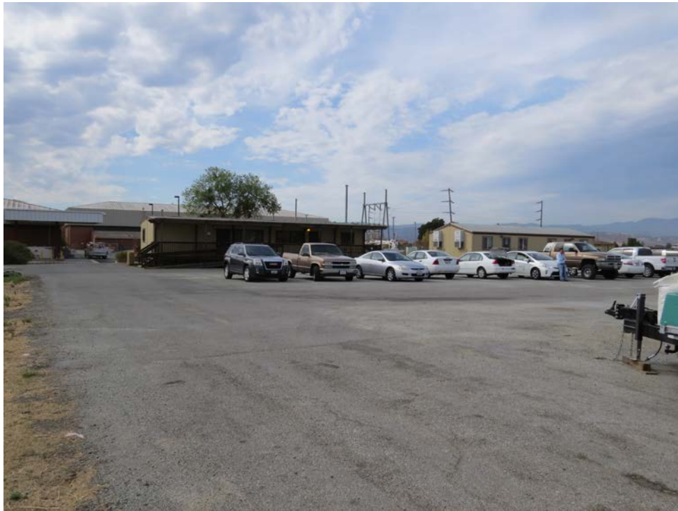
View from the Project site looking south towards the portion of the Coyote Pumping Plant.